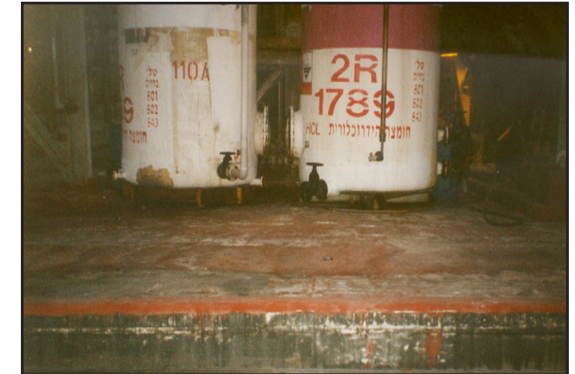
ARC 988 coated floor areas