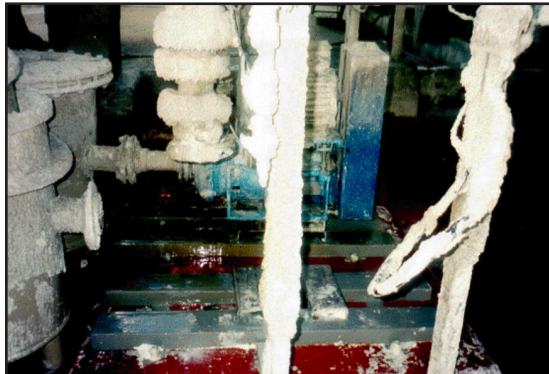
ARC 988 coated pump base: good condition after 4 years

Continuous exposure to 54% H 3 PO 4 attacks cement paste in concrete leading to concrete degradation.